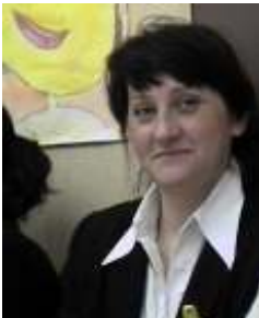
Presentation of Mother Center Guatemala

"In our country there is much racism, the only language to use is Spanish, it is compulsory from the first day in school where the only white person is the teacher. In our Mother Center we want to use the local languages and keep the culture of the people. That way the children see their mother as a person who can teach something"