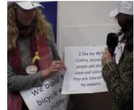
(Participant from Kenya)

"The word mine means mother in my language. I feel pregnant with the soon to be born Mother Center in my home town of Kisumu. It will be born as soon as I get back home."