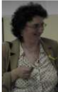
"Beautiful, interesting, clever women met here". (Slovak organizer)